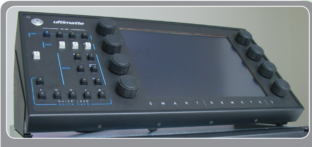
Smart Remote 2 sold separately